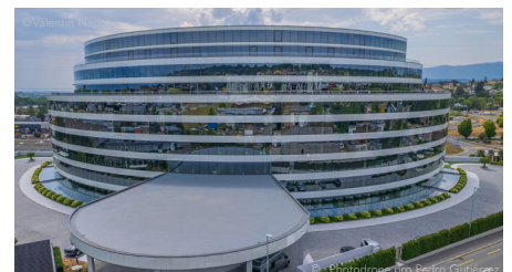
Millennium Crissier, Switzerland