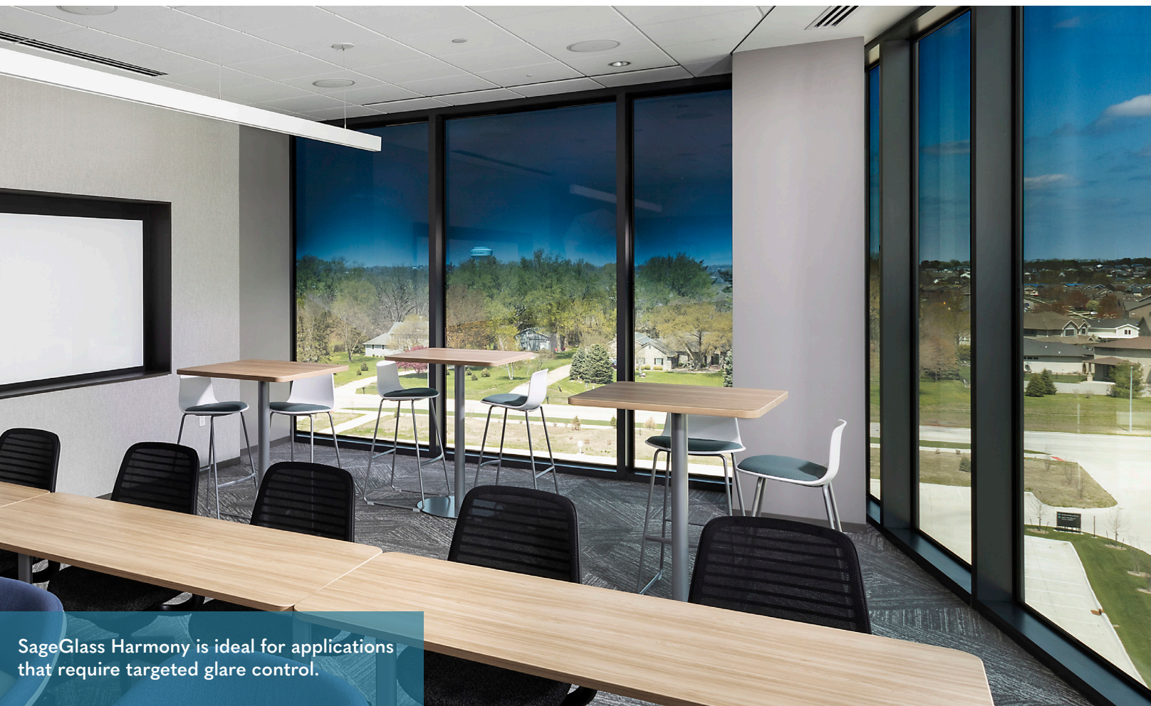
SageGlass Harmony is ideal for applications that require targeted glare control.