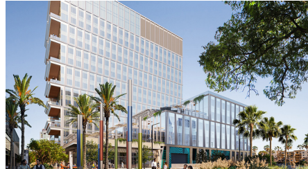
IQHQ Research & Development San Diego, USA