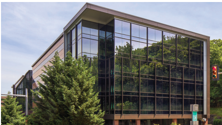
Keystone Properties 1K1 Conshohocken, USA