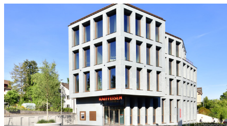
Raiffeisenbank Wallisellen, Switzerland