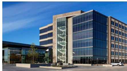
Sammons Financial Group Bengaluru, Des Moines, USA