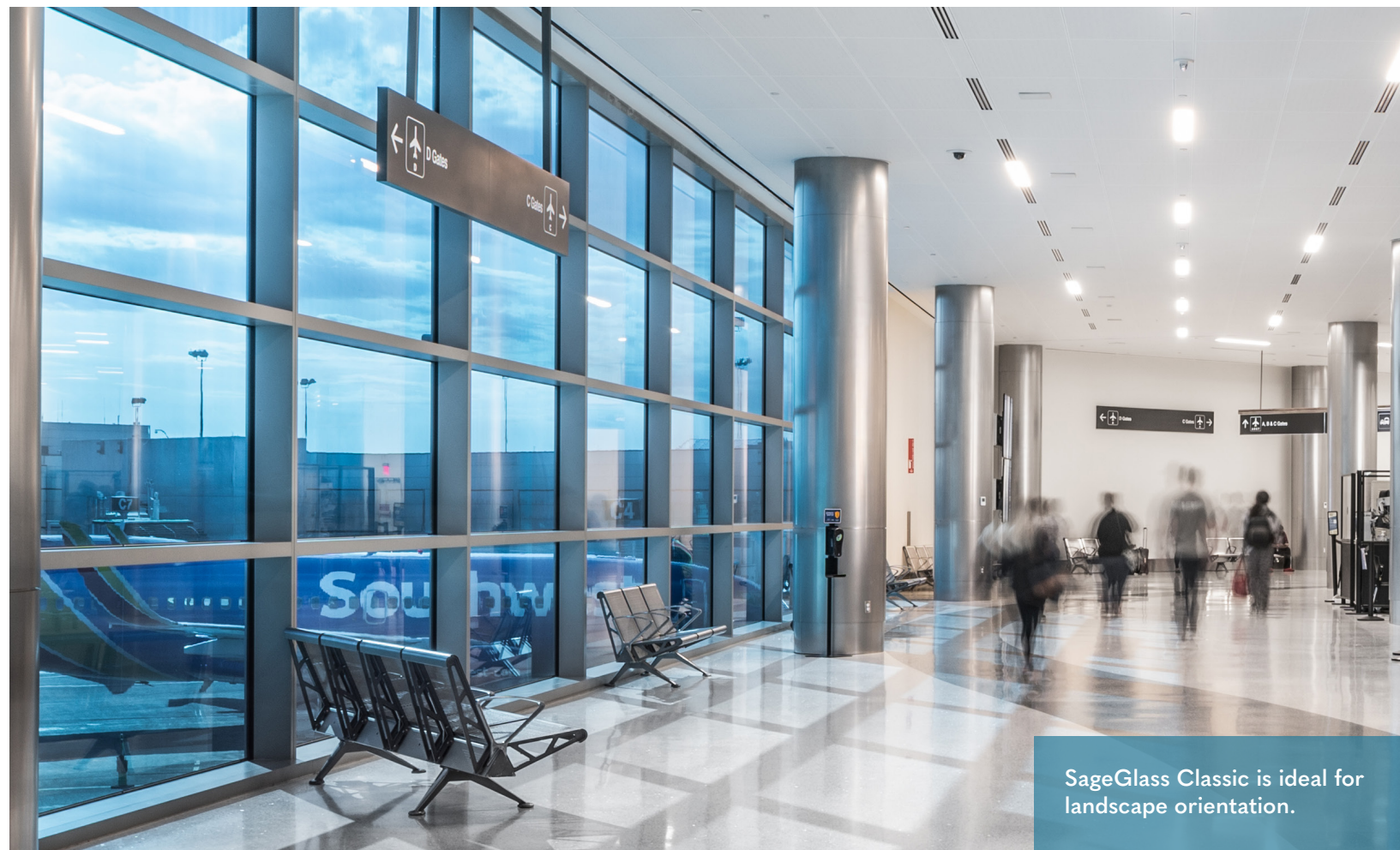
SageGlass Classic is ideal for landscape orientation.