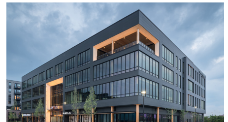
40Ten Canton Baltimore, USA