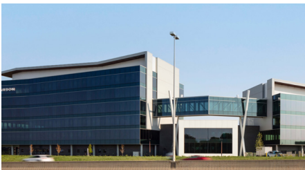
Carson Group Headquarters Omaha, USA