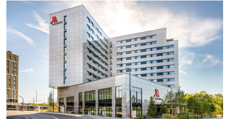
Geneva Marriott Hotel Geneva, Switzerland