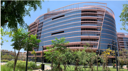
Google Bagmane Rio Bengaluru, India

Projects worldwide have selected SageGlass Harmony smart windows to provide occupants the ultimate connection to the outdoors.